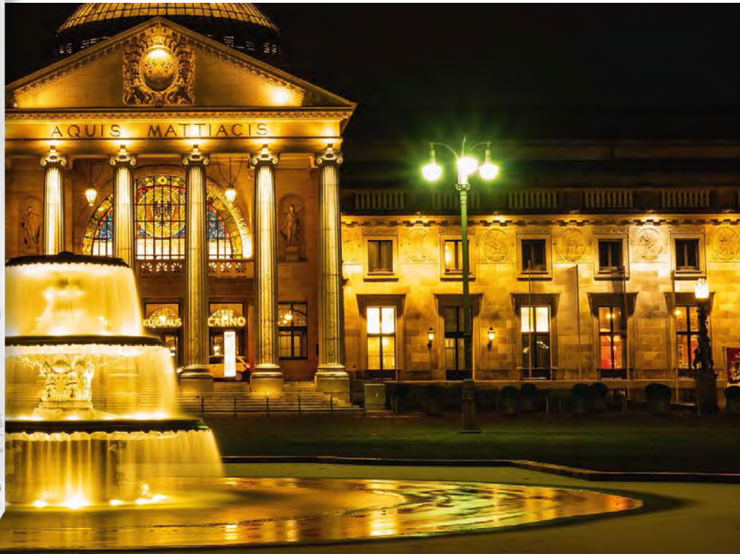
Gala evening in the Kurhaus Wiesbaden