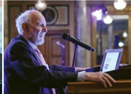
Prof. Dr. Ernst Ulrich von Weizsäcker (Honorary President Club of Rome) 2023